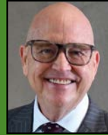
JUDGE THOMAS TRENT LEWIS (Ret.) Signature Resolution