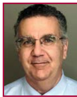
JUDGE CHARLES NOVACK U.S. Bankruptcy Court Northern Dist. of Calif.