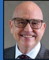
JUDGE THOMAS TRENT LEWIS (Ret.) Signature Resolution